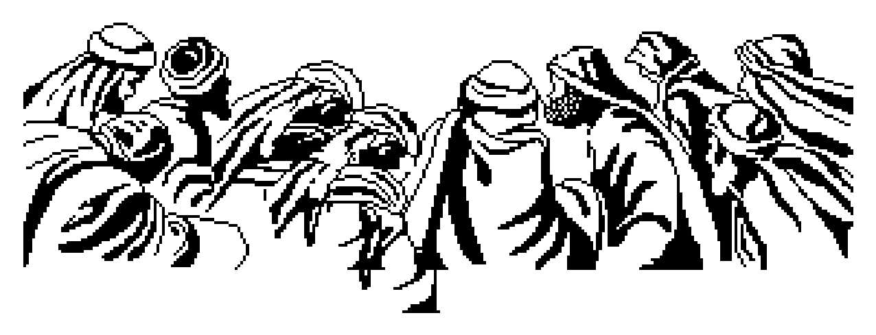
"Happy is the man who has his quiver full of them." PSALM 127:5