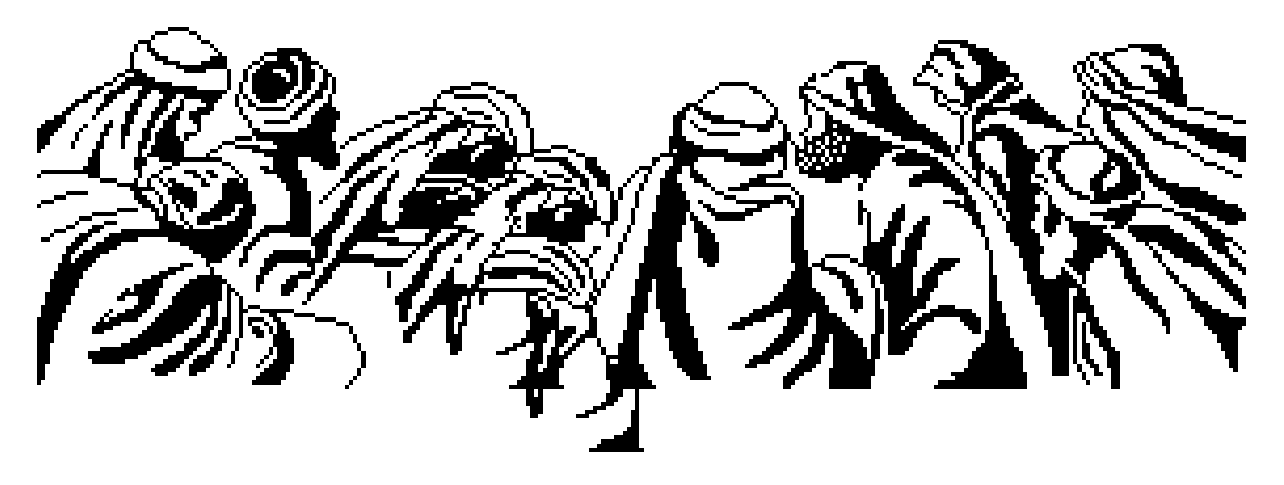
"Happy is the man who has his quiver full of them." PSALM 127:5