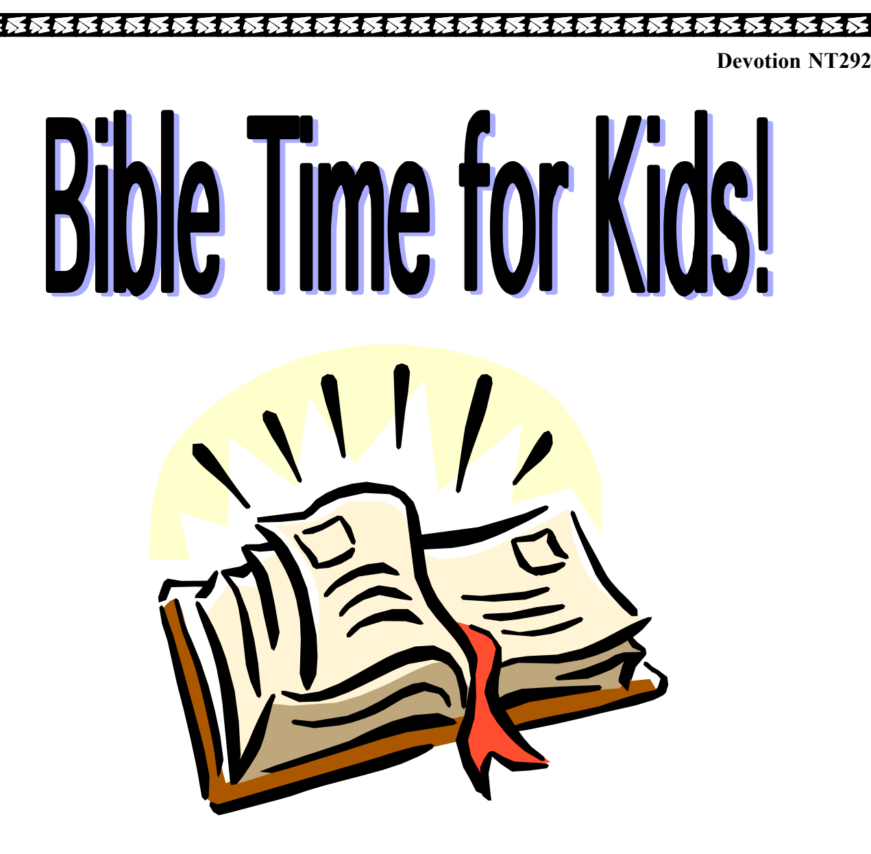
CHILDREN'S DEVOTIONS FOR THE WEEK OF: